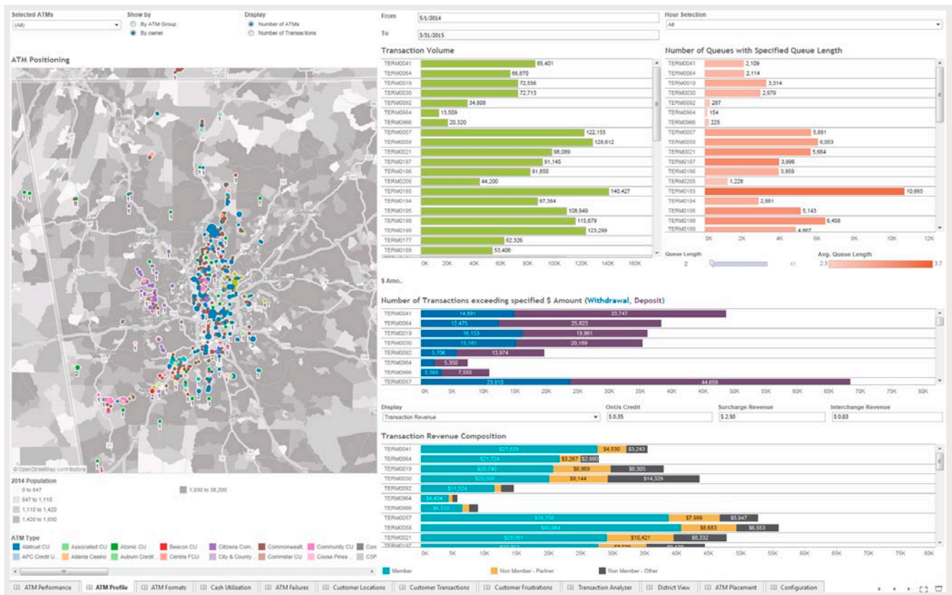
SCREENSHOT: INETCO Insight dashboard example — Understand the placement and profitability of every ATM or POS device in your fleet.